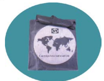
Cutting more complex pattern on more material