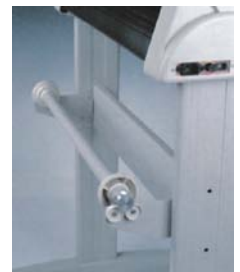
New supply paper system, run more stably